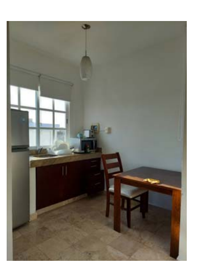
Brunch is included. Dinner will be on your own.

You may never want to leave Isla - and for 4 days, you won't have to!